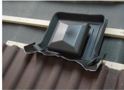
Place the vent resting on the batten installed for support (ref. picture 2).