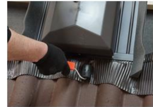
Make sure butyl strip is firmly fixed. If necessary use roller.