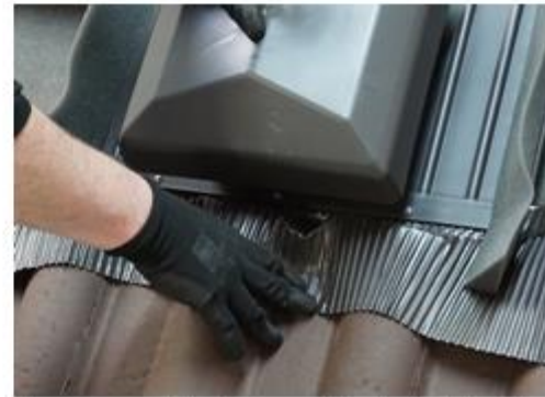
Press on profile low-point to fix butyl adhesive strip.