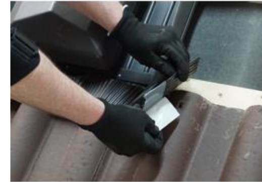
Tiles must be dry and clean before fixing butyl. Remove protective foil from the butyl adhesive strip.