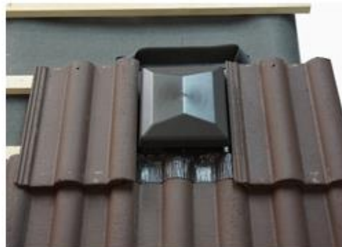
Make sure the gap between vent and tile is the same size on both sides.