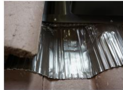
Mould butyl strip to allow water to escape.