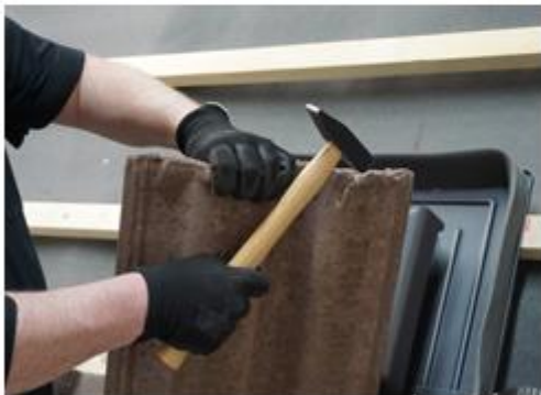
Use hammer to adjust tiles on both sides of the vent where they rest on the foam wedge.