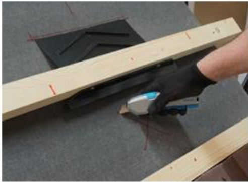
Cut an X.