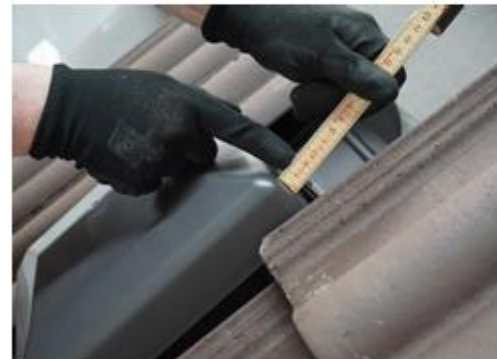
Adjust the length of the tile above the vent to leave a gap of 15 mm