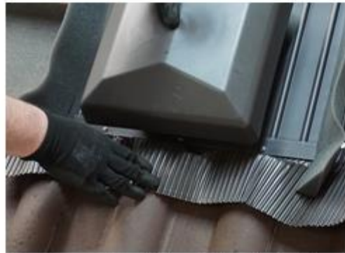
Press on profile high-point to fix butyl adhesive strip.